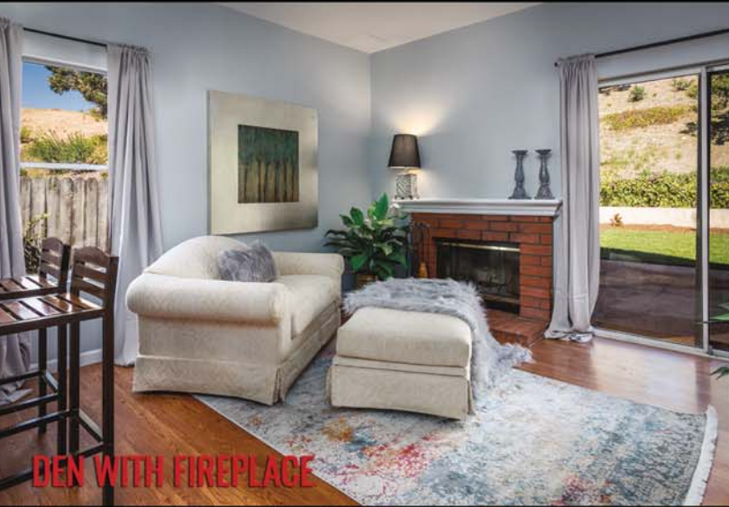
DEN WITH FIREPLACE