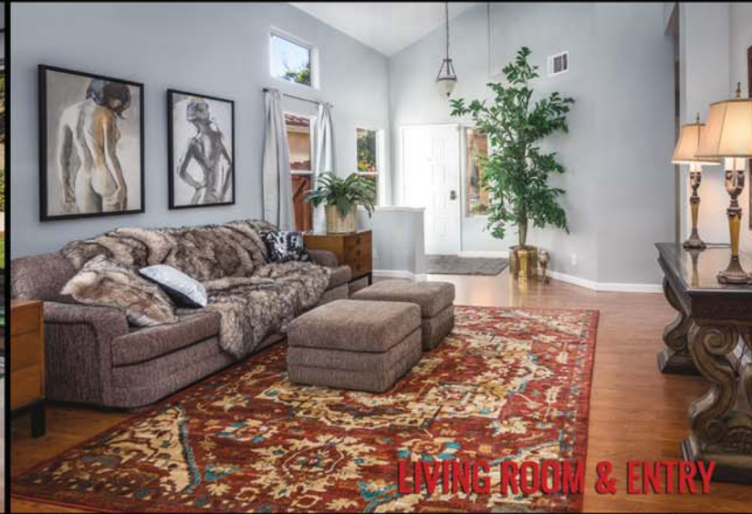
LIVING ROOM & ENTRY