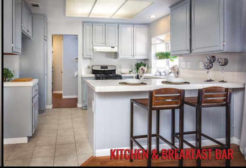
KITCHEN & BREAKFAST BAR