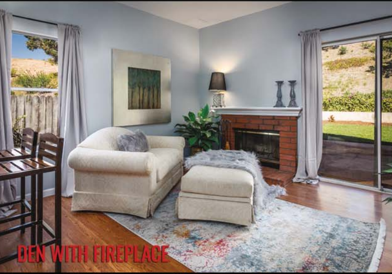
DEN WITH FIREPLACE