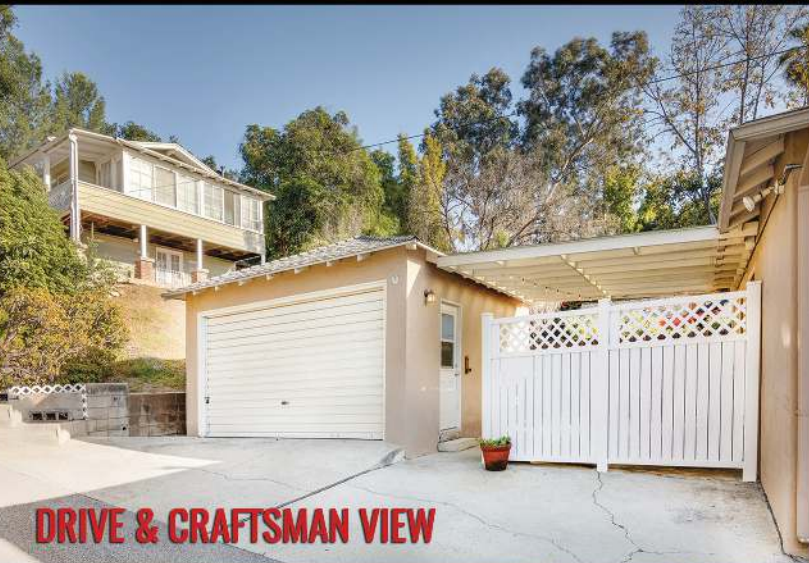
DRIVE & CRAFTSMAN VIEW