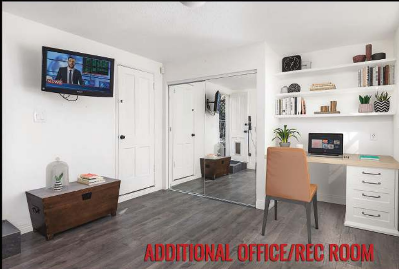
ADDITIONAL OFFICE/REC ROOM