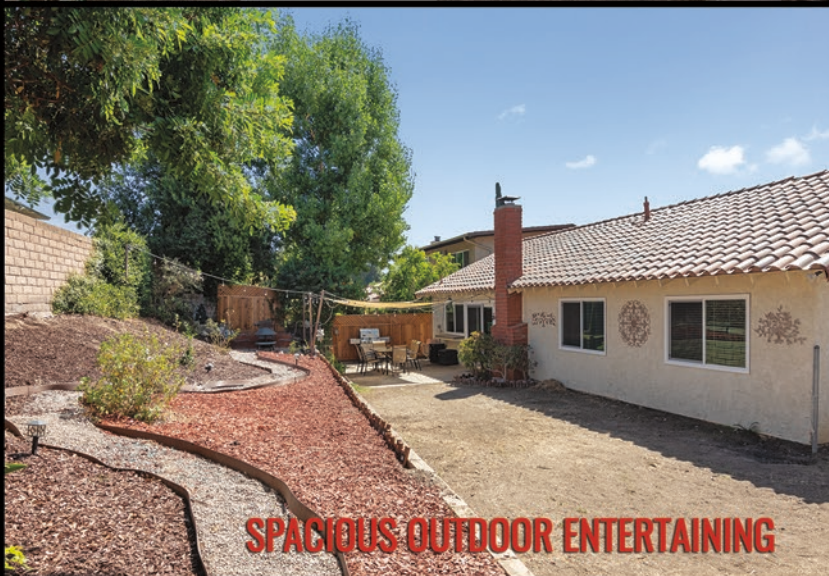
SPACIOUS OUTDOOR ENTERTAINING

WWW.CMBHOMES.COM/PROPERTIES/4025-TEMPE-CT